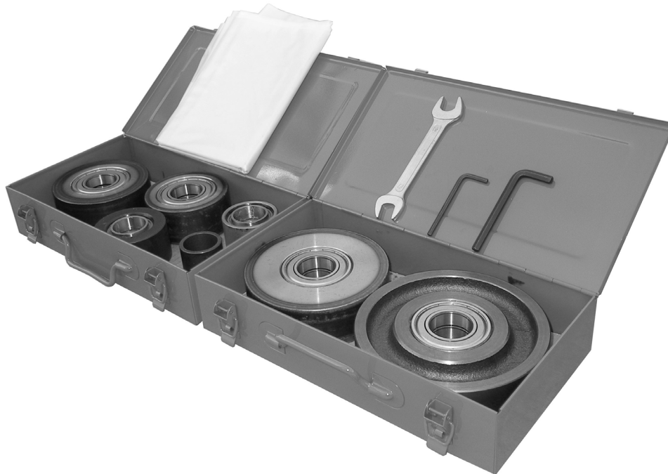
DBD-32X Roller Set, Tool Kit, and Steel Case

* Use a second #4 Roller as moving roller to produce 180° bends